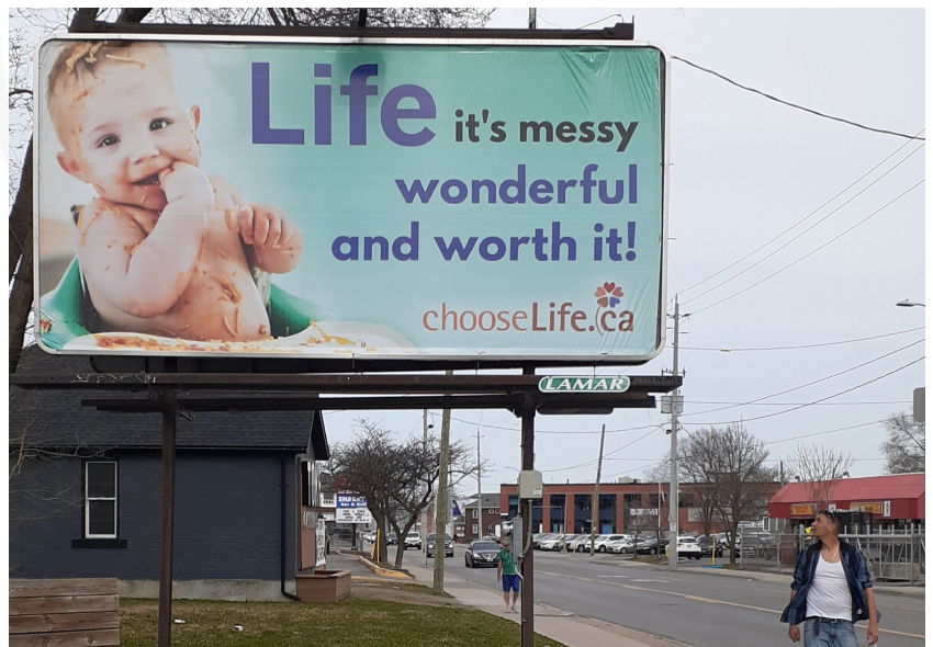
One of our billboards is capturing attention as it pops up throughout the region this spring.

Ontario abortion rates are going up, as reported by the Ontario Ministry of Health and Long-Term Care. There were 46,189 abortions in the province in a one-year period from 2019 to 2020, up 7.8% from two years earlier. From 2014 to 2017, the number of abortions had been in a downward trend, but since 2017, the numbers have been going back up, surpassing 2014 numbers, likely due to the abortion pill which became legal in 2017.